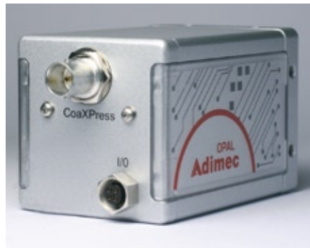
CoaXPress camera

The driving force for this new high speed technology derives primarily from im-